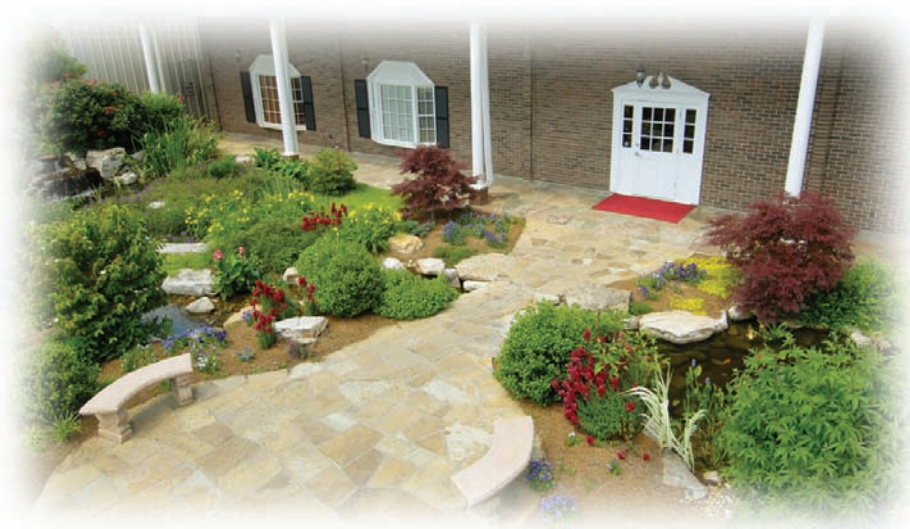
Front entrance of Americo's corporate offices.

This area has been certified by the National Wildlife Federation as an official "Backyard Wildlife Habitat".