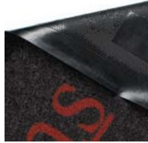
Backing with gripper surface promotes stability and safety on hard surfaces as well as on carpeted floors.